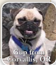
Gup from Corvallis, OR